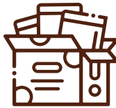
SACHETS IN A CARTON